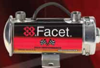
FACET® / PUROLATOR® GOLD-FLO® ELECTRONIC FUEL PUMP

FUEL PUMP COVERAGE FOR LOW AND HIGH-PRESSURE AUTOMOTIVE APPLICATIONS EXACT FIT, HIGH QUALITY, ENGINEERED TO LAST