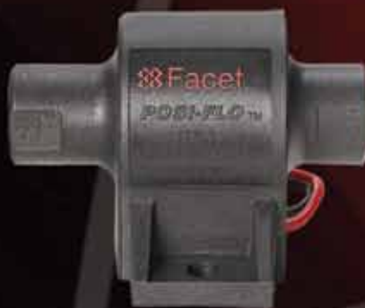
FACET® / PUROLATOR® POSI-FLO® ELECTRONIC FUEL PUMP