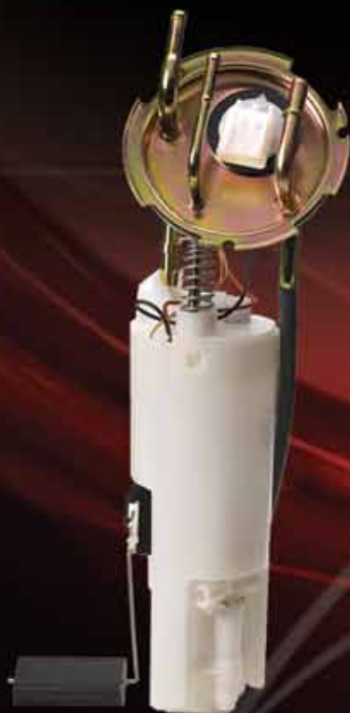
FACET® / PUROLATOR® ELECTRONIC FUEL INJECTION PUMPS AND MODULES