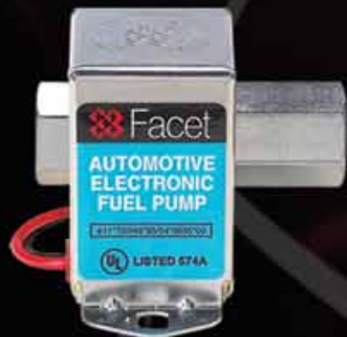
FACET® / PUROLATOR® CUBE ELECTRONIC FUEL PUMP